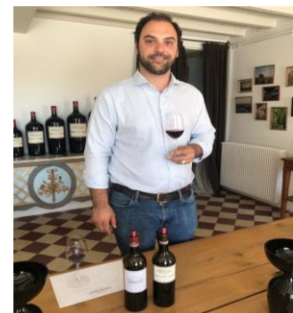
Ferréol du Fou