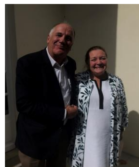
Camille Sereys de Rothschild