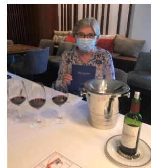
Malou Le Sommer